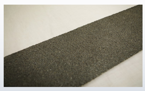
Dynagrip aggregates makes it virtually impossible to slip and fall due to prevailing bad conditions.

A natural choice for OHS conscious operators and green class vessels.