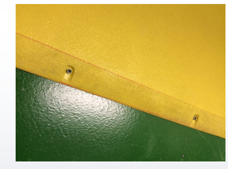
Sloped deck fastening rim