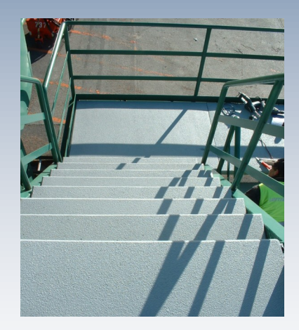
Boarding stairway with smooth anti-skid surface and integrated heating function.

Marine Enclosed Step Covers are manufactured with the same Conficomp technology as the Anti Ice Deck Pads, with integrated heat.