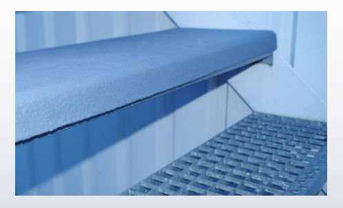
An enclosed step cover (sand coated) versus a grated step.