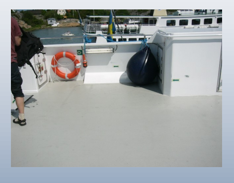
AIDP's integrated in the composite deck onboard passenger ferry.