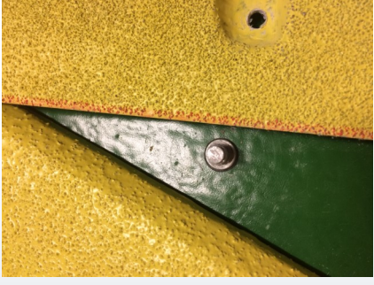
Deck fastening detail (Hilti X-BT)