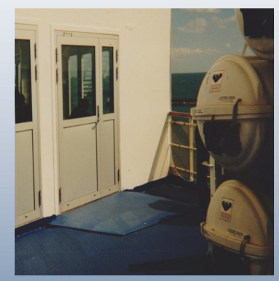
An elevated (heated) access ramp with the Conficomp technology, onboard Stena Danica.