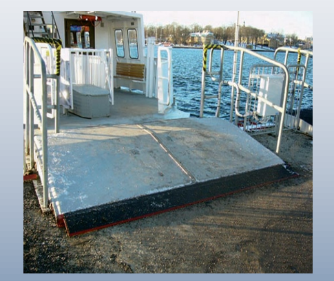
Access ramp with integrated heating function on a small passenger ferry in the Baltic sea.